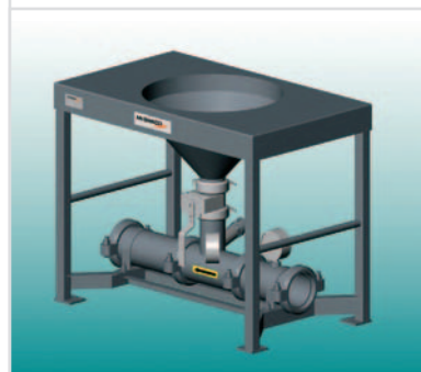
HIRIDE Hopper Model 175 SE