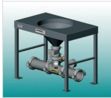
HIRIDE Hopper Model 175 FE